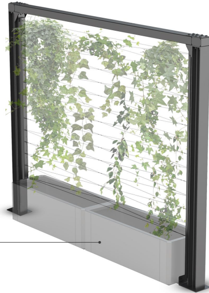
Stilo planter 06.048.L (sold separately)